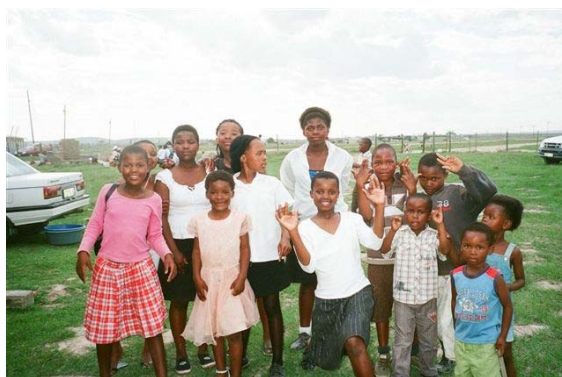
Children from our Sister Church, Khulani Church, Mthatha Presbytery

"We are walking in the light of God together"